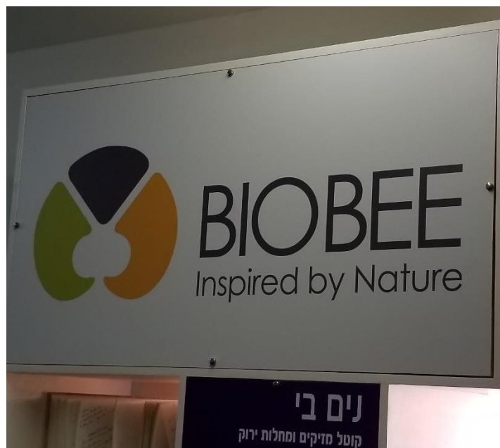
BioBee at Sde Eliyahu

After a wonderful dinner at the Kibbutz, we attended the Beit She'an sound and light show. It included a nighttime tour where the guide explained about the civilizations that were built, one upon another, over the centuries. In 749 AD a huge earthquake destroyed the city with the Jordan River flooding it. Excavations have slowly uncovered the ruins.