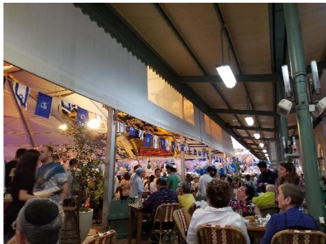
Celebrating Yom Ha'Atzmaut at the first RR station in Jerusalem

It was time to get to the First Station RR in Jerusalem for havdalah between Yom Hazikaron and Yom Ha'Atzmaut. Once the sadness of Yom HaZikaron was over, there was non-stop celebration, music, fireworks, and dancing - in which we all participated. We then departed for a celebratory dinner and continued celebrating 70 Years!