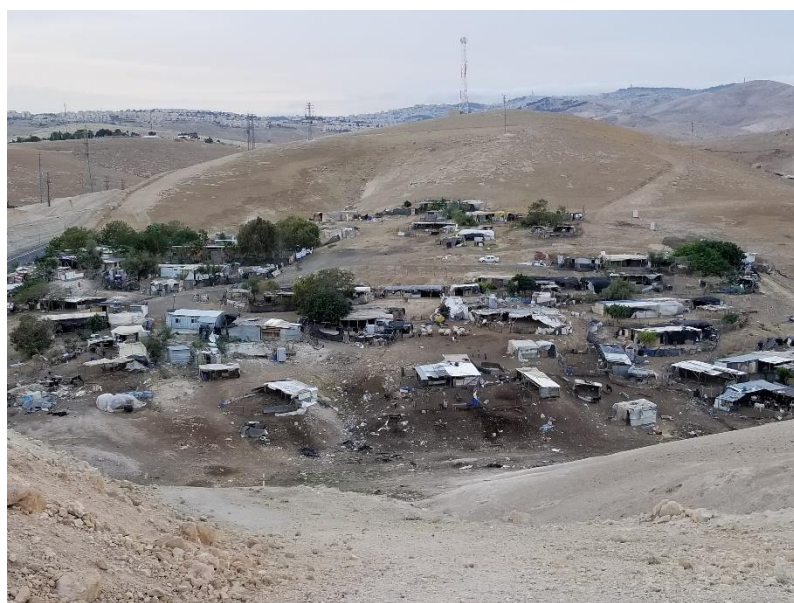
Illegal Bedouin Villages on Israeli land