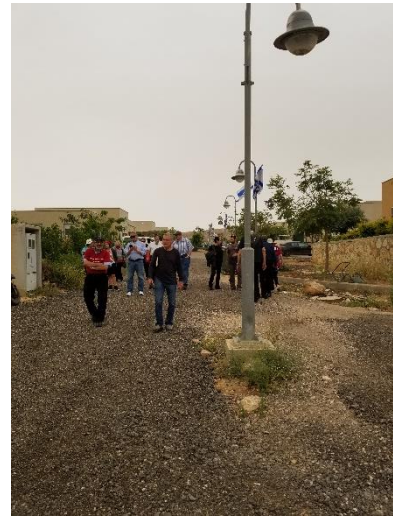
Main street in Maskiot