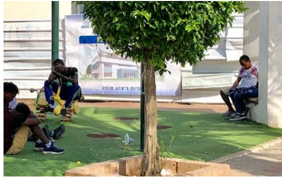
Street scene in Tel Aviv

We traveled on to Jerusalem and ended the day by attending a very moving Yom HaZikaron ceremony at the Kotel.