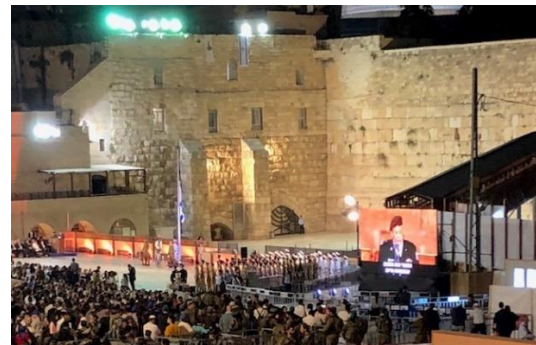
Two nighttime views at The Kotel on Yom HaZikaron