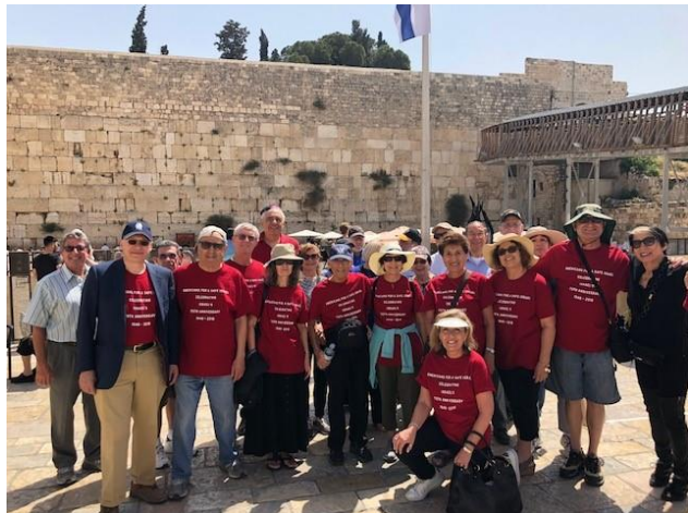
L – R: Our visit to the Kotel in Jerusalem

The Kotel in Jerusalem was our first stop. We enjoyed the fascinating video tour of the "Jerusalem Journey" - offered by the Western Wall Heritage Center.