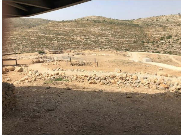
Beautiful view of Shiloh