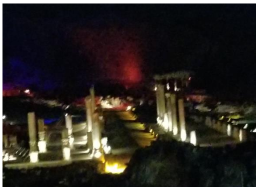
Beit She'an Sound and Light Show

After a wonderful dinner at the Kibbutz, we attended the Beit She'an sound and light show. It included a nighttime tour where the guide explained about the civilizations that were built, one upon another, over the centuries. In 749 AD a huge earthquake destroyed the city with the Jordan River flooding it. Excavations have slowly uncovered the ruins.