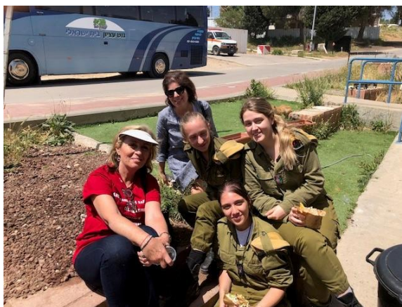
Above 2 photos taken at the Gush Etzion Army Base