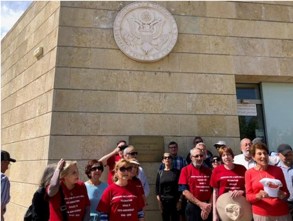
Outside what became the new site of the United States Embassy in Jerusalem!!

AFSI may be the first American group to gather at the Israeli Consulate in Jerusalem recognizing it as the new US Embassy in Jerusalem. We assembled there, taking photos and singing anthems to mark our visit.