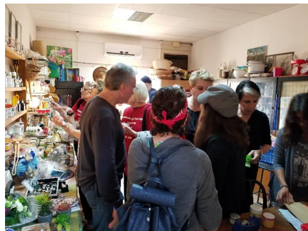
Shopping in Rotem