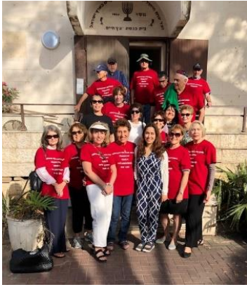
In Tel Aviv May Golan