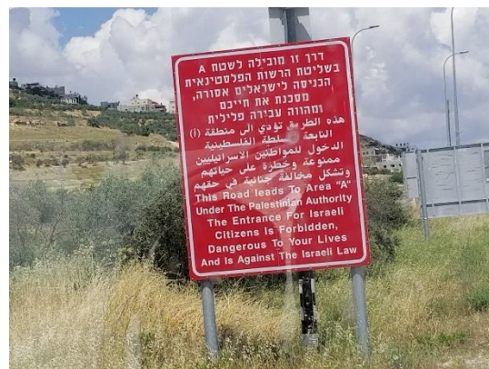
Sign forbids entrance to Israelis – meaning Jews