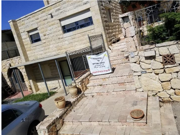
Home in Netiv Avot scheduled for demolition

Elazar, Alon Shvut, and Netiv Avot are all very close to each other. Netiv Avot is slated for the demolition of 16 homes on June 20. Caravans will be placed in Netzer, near Elazar, where AFSI had planted trees with the Women in Green, in order to keep the land in Israeli hands.