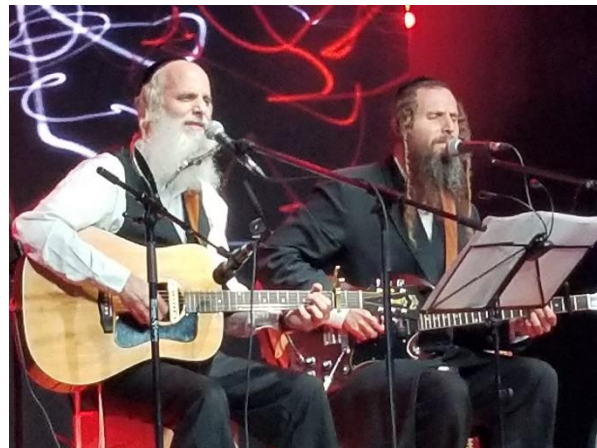
Entertainers at United Hatzalah Dinner