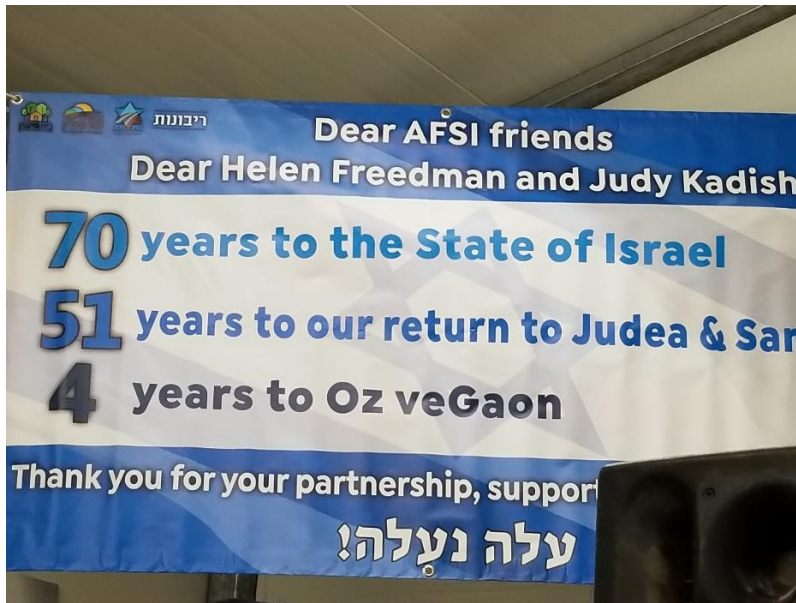
AFSI is warmly greeted in Oz v'Gaon