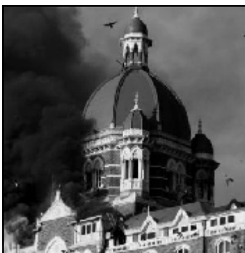
The Taj Mahal Hotel in Mumbai burning.

It's almost as if nothing happened at Chabad House, that no Jews were tortured and killed for the simple reason that they were Jews.