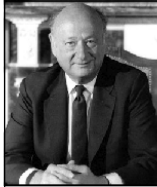
Ed Koch—He should have read New Media.