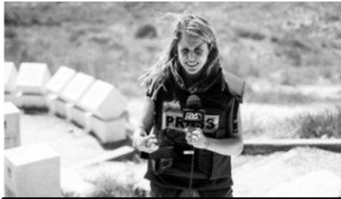
A reporter near the Gaza border

Is there anything left to say about Israel and Gaza? Newspapers this summer have been full of little else. Television viewers see heaps of rubble and plumes of smoke in their sleep. A representative article from a recent issue of The New Yorker described the summer's events by dedicating one sentence each to the horrors in Nigeria and Ukraine, four sentences to the crazed génocidaires of ISIS, and the rest of the article—30 sentences—to Israel and Gaza.