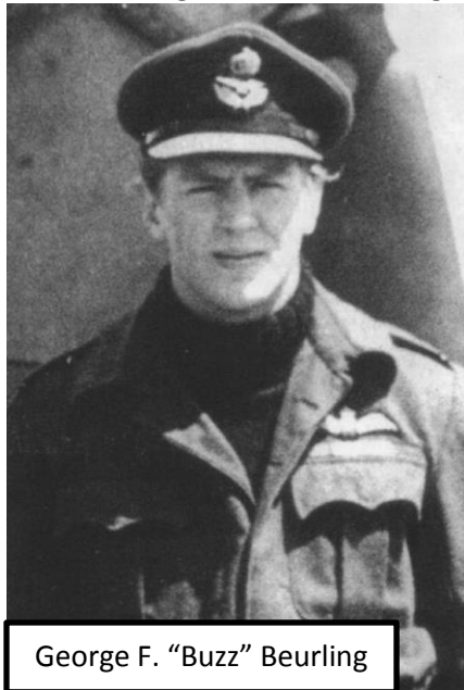
George F. "Buzz" Beurling

George F. "Buzz" Beurling, of the Royal Canadian Air Force, was the top Canadian combat air ace