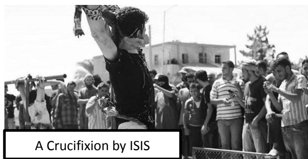
A Crucifixion by ISIS

It seems the Obama administration, which was convinced Islamic State was retreating and perhaps even on the brink of collapse, was the only one to be surprised by the group's success.