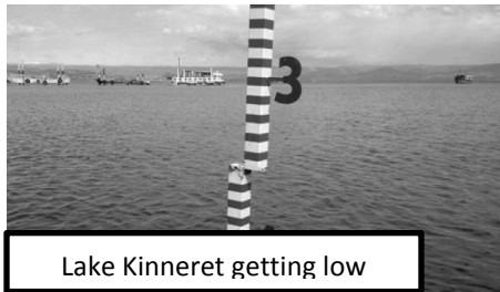
Lake Kinneret getting low

Second: The size of Israel including Judea and Samaria...Well, it would fit cozily inside of Lake Michigan.