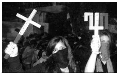
Syrian Christians Protest in Syria

In the wake of the Orlando shooting spree, President Obama has announced an acceleration of his program bringing Syrian refugees to this country. But not the ones in greatest need of refuge. Not the ones likely to assimilate culturally. Not the ones unlikely to become or produce terrorists. Not Christians or Yazidis.