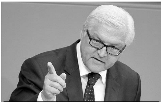
Frank Walter Steinmeier