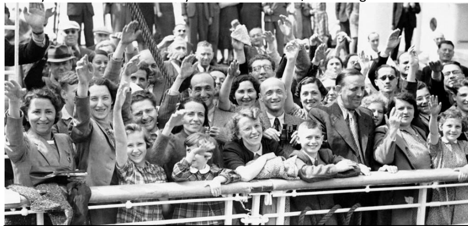
Jewish refugees on the St. Louis

Should the day come when Jews find themselves disempowered, vulnerable, and threatened 20 to 30 years from now in a very different America, one thing Jewish leaders as well as ordinary American