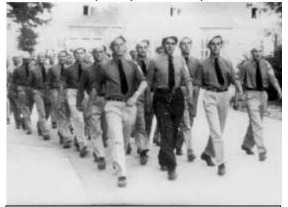
Betar Demonstrating for Immigration

Consequently, Jabotinsky left mainstream Zionism and established the Revisionist Party within