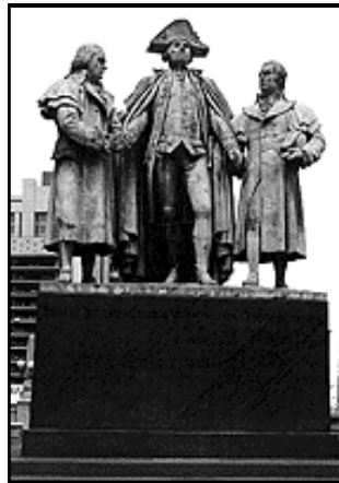
George Washington, Morris, and Salomon