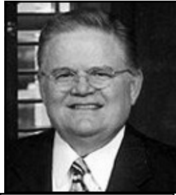
John Hagee—Christians United For Israel

Ironically, the most effective Biblical-based defense of Judaism's God-given right to the Land of Israel emanates today not from Israel, not from Jews, but from the substantial majority of America's 70 million Bible-oriented Christians -- the Christian Zionists, as they proudly identify themselves. Only those unfamiliar with the intense love and familial attachment that brings tens of thousands of them to Israel's shores each year would be surprised by the fact that up near the top of the list of major concerns enumerated by the U.S. Christian Coalition in the millions of voter guides it is distributing for the 2006 Congressional elections is Israel, its security and its spiritual and territorial integrity.