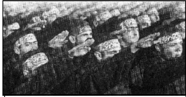
A Parade of Hamas Recruits

That same year the late President Ezer Weizman, a famed combat hero, was reputed to have taken large contributions from businessmen without reporting it to the proper authorities. Although he was never