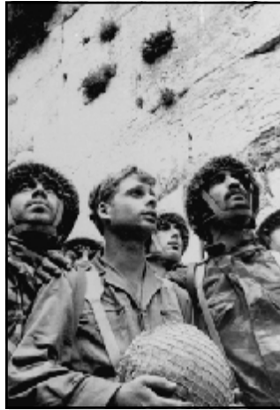
Soldiers at the Western Wall, June 1967

It is a bitter anniversary, with no cause for celebration.