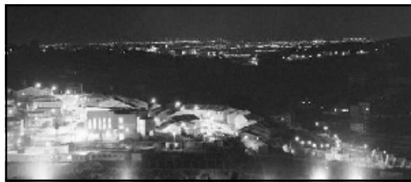
Beit El in foreground, Tel Aviv in rear.

When the first Jews returned to Israel from the Babylonian Exile, several hundred of them rebuilt Beit El. Subsequently, during the Hasmonean revolt, Judah Maccabee and his men found refuge in the hills of Beit El, going forth from there to do battle against their Syrian Greek enemies. With the fall of the Second Temple, the Jewish community of Beit El was also destroyed. It remained neglected and unproductive until it was reestablished on the Jewish autumn holiday of Sukkoth 1978, just a decade after Israeli forces had assumed control of the area in the Six Day War. Be-