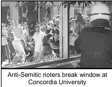
Anti-Semitic rioters break window at Concordia University