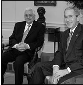
President Bush with Abbas

As for Israel, it engages in the same old pattern, constantly repeated since Oslo, of releasing terrorists, 250 of them this time, to show, says Olmert "our hand outstretched in peace." In the real world the government is simply showing it is not serious about combating terror and in its obsession with appeasement is prepared to act as enabler for the future murder of Israeli citizens. (Additional evidence is that it goes on supplying Gaza with electricity, gas, food and all types of so-called "humanitarian assistance," further enabling its enemies.) In another oft-repeated "goodwill gesture" it has released $120 million to Abbas, which, if past is prologue -- and it surely is -- will chiefly go to fund more anti-Israel terror and villas in the Mediterranean. If anything, Fatah officials will feel a more urgent need to pile up funds in foreign bank accounts; they must now be acutely conscious that Hamas may soon take over, putting an end to the