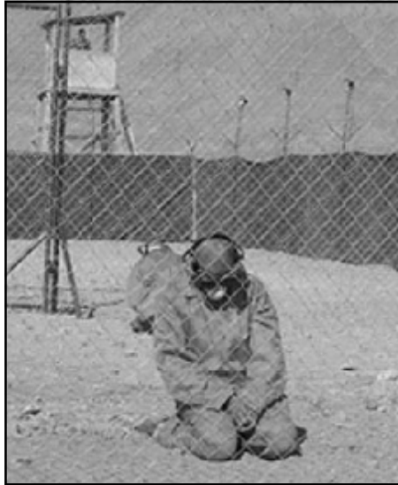
Prisoners in Guantanamo

So if the War on Terror is a fraud, no more than a grotesque conspiracy designed to implement some kind of garrison state, what does that make the "terrorists"? What else but victims? Victims suffering horribly amid the abuses of Guantanamo and the rendition prisons. Victims standing alone against the full power of the state, victims deserving all the assistance