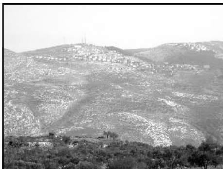
Elon Moreh seen from Mt. Ebal

Kaddum (now known as Kedumim) has since flourished and grown into a substantial town, but our nucleus was still determined to settle in Biblical Elon Moreh. Even as we built Kedumim, we looked east to Mt. Gerizim and Mt. Ebal. Our opportunity came in 1977 when Menachem Begin was elected Prime Minister. On Tu Bishvat (the traditional Arbor Day) in 1980, our garin moved to the site of our present village on a mountaintop overlooking the city of Shechem. Elon Moreh is two miles east of Shechem, facing Joseph's Tomb, Mt. Gerizim and Mt. Ebal. Today, a multi-cultural microcosm, 250 families from 25 countries live here, over 20% recent immigrants from Peru, Russia, India, the U.S. and England.