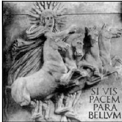
If you want Peace, Prepare For War