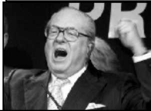
Jean Marie Le-Pen