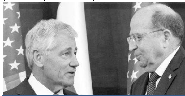
Chuck Hagel with Moshe Yaalon

Israel is very worried that the administration's ceaseless courting of Iran belies any seriousness about stopping its nuke program. Against Israel's warnings and advice, Obama backed Mohamed Morsi's (fortunately short-lived) Muslim Brotherhood regime in Egypt. After the 2012 Gaza war, the administration, together with Morsi, pushed Israel into a deal that allowed Hamas to rearm and set the stage for this year's war.