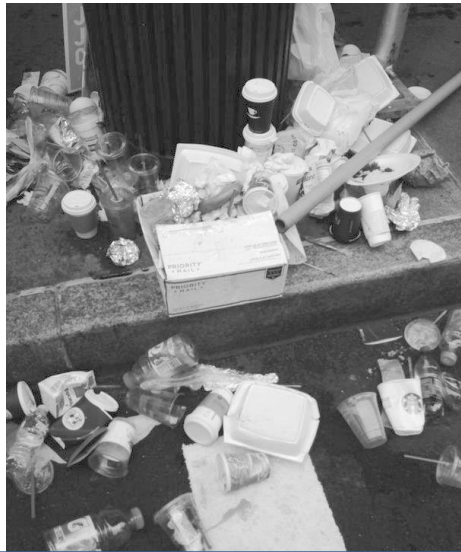
People’s Climate March Trash

Celebrities and politicians piled on the rhetoric to raise the temperature for the UN confab starting the next day. The Pied Piper of Climate Change Al Gore led the way. No less an authority than actress Emma Thompson announced “This is the battle of our lives.” Mayor Bill de Blasio declared “We know humanity is facing an existential threat.” Robert Kennedy Jr. had this to say of politicians who remained skeptical. “They are contemptible human beings. I wish there were a law you could punish them with.” Just in case the public believed there might be more urgent threats, Secretary of State Kerry declared that climate change should be addressed with as much “immediacy” as confronting the Islamic State and the Ebola outbreak.