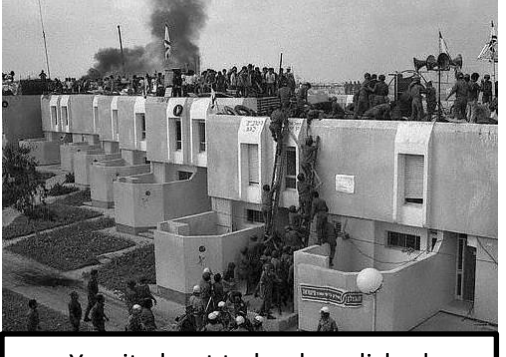
Yamit about to be demolished

Rabbis at prayer slaughtered like sheep. Sons and daughters abducted, run down shot and knifed: the payback for weak-bellied appeasements. Never mind the terror it brought; does the international community love Israel any better?