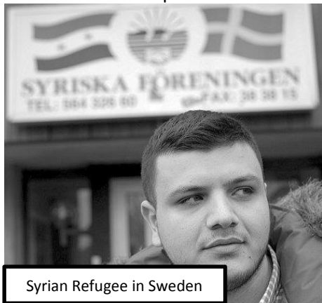
Syrian Refugee in Sweden

As if more proof of Sweden's incomprehension were needed, Margot Wallström stood up in the