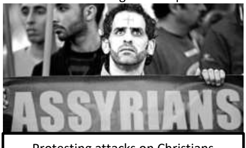
Protesting attacks on Christians

If there is a genocide parallel it involves the Christians of the Middle East who have for decades