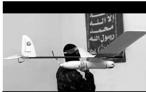
Hezbollah fighter with drone

Hezbollah is currently mired in Syria's civil war with 1/3 of its forces actively engaged in Syria to prop up Assad. In light of this, most Israeli experts agree that the probability of war breaking out in the near future is low. The last thing Hezbollah needs now is a two-front war. Nevertheless, Hezbollah's raison d'être is to serve the Islamic Republic's interests and do battle with Israel. A showdown with the terror group is therefore inevitable. The only question is "when," not "if."