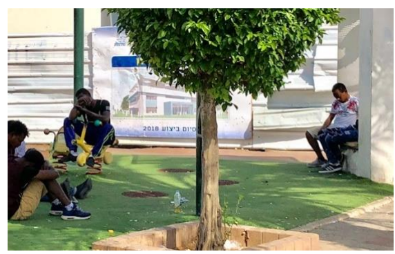
Street scene in Tel Aviv

We traveled on to Jerusalem and ended the day by attending a very moving Yom HaZikaron ceremony at the Kotel.