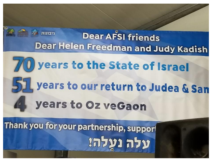
AFSI is warmly greeted in Oz v'Gaon