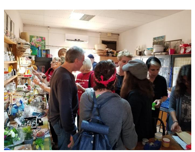
Shopping in Rotem