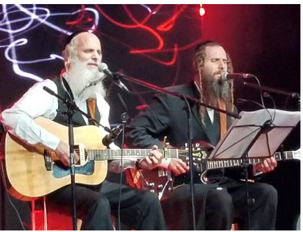
Entertainers at United Hatzalah Dinner