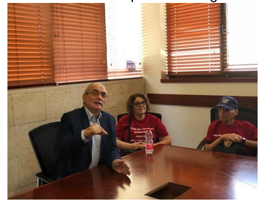
Meeting with Brig. Gen. (Res.) Yosef Kuperwasser

serious. Arabs inherit their refugee status; being a Shaheed - dying for Islam - is indoctrinated.