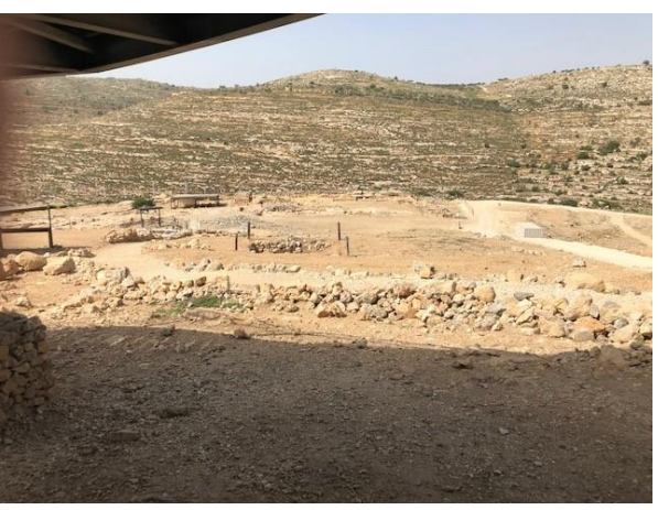
Beautiful view of Shiloh