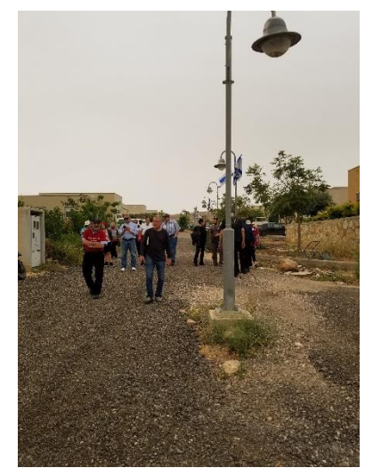
Main street in Maskiot

cameras since the old ones were taken over the areas. Steps are already underway to help the situation.