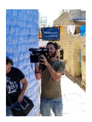
Channel 1 filming our group