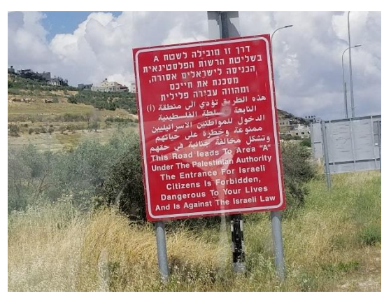
Sign forbids entrance to Israelis – meaning Jews