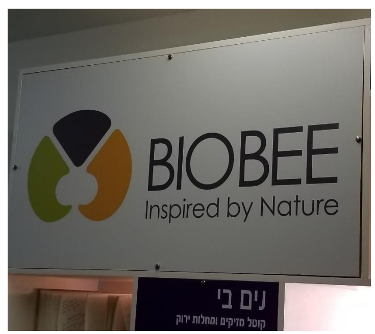
BioBee at Sde Eliyahu

After a wonderful dinner at the Kibbutz, we attended the Beit She'an sound and light show. It