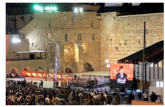
Two nighttime views at The Kotel on Yom HaZikaron