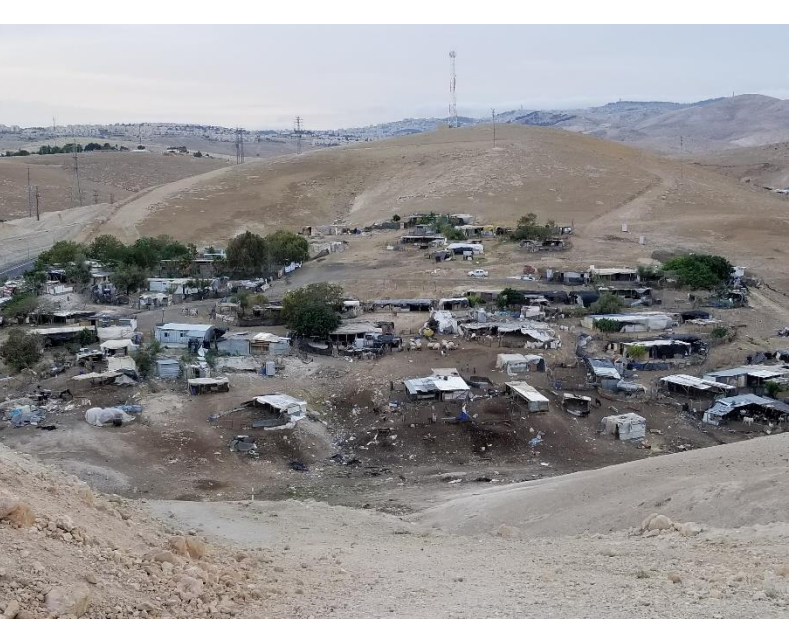
Illegal Bedouin Villages on Israeli land