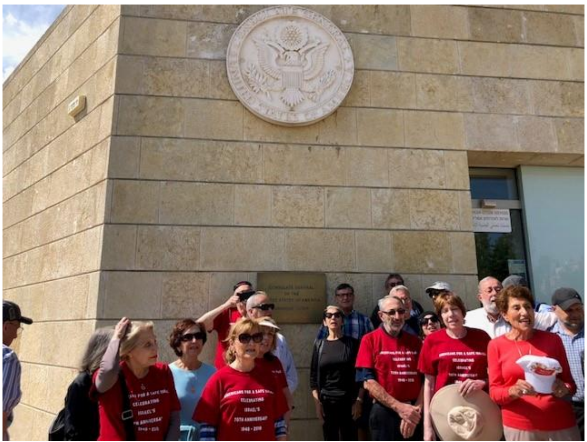
Outside what became the new site of the United States Embassy in Jerusalem!!

AFSI may be the first American group to gather at the Israeli Consulate in Jerusalem recognizing it as the new US Embassy in Jerusalem. We assembled there, taking photos and singing anthems to mark our visit.