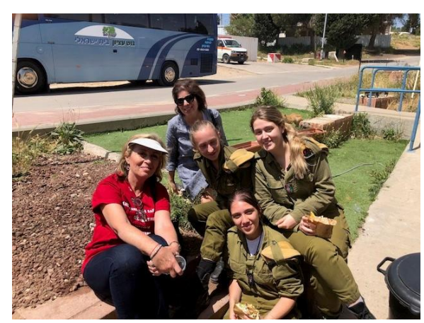
Above 2 photos taken at the Gush Etzion Army Base