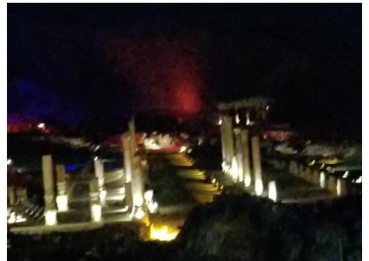
Beit She'an Sound and Light Show

After a wonderful dinner at the Kibbutz, we attended the Beit She'an sound and light show. It