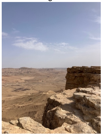
At Makhtesh Ramon overlooking the Ramon Crater

sits on the edge of the Makhtesh Ramon, the