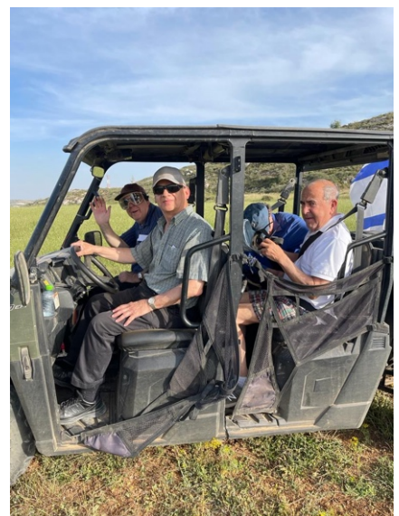
Cruising in an ATV in Shiloh

Next, after what was an action-packed day, we head to Tel Aviv where we will spend the next 2 nights at the Brown Beach Hotel just a block off the remarkably vibrant beachfront but more on that later. For now, we need to get checked in and cleaned up quickly and get to our reservation at a lovely Kosher Tripolitan/Libyan restaurant named Guetta (all restaurants we go to as a group are certified Kosher). We're in the big city now, so once we all make our way,