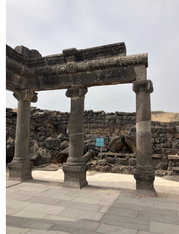
L & R: Korazim

ranch called Vered Hagalil , in the hills overlooking the Sea of Galilee for a very elegant evening meal. Back at the house, after dinner there was opportunity for some rooftop stargazing for those of us with any energy left. It was a momentous day!