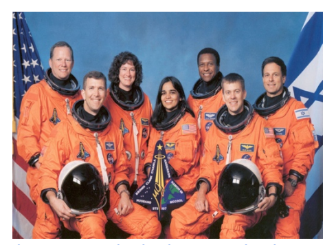
Ilan Ramon and Columbia Space Shuttle crew

Next stop before we hit the highway is the Ilan Ramon Museum and Memorial on the edge of the 'crater' at the Makhtesh Ramon visitor center. It's dedicated to the memory of Israel's first astronaut, who tragically died in the 2003 Space Shuttle Columbia disaster when the shuttle disintegrated upon re-entering the Earth's atmosphere. The exhibition provides an intimate glimpse into his life, family and amazing if not tragic story. Overlooking the uniquely lunar-like landscape of the Ramon Crater, this is a most fitting setting for this memorial as Ilan Ramon not only trained in the area, but he also changed his name earlier in life thanks to his love for this part of Israel's Negev Desert.