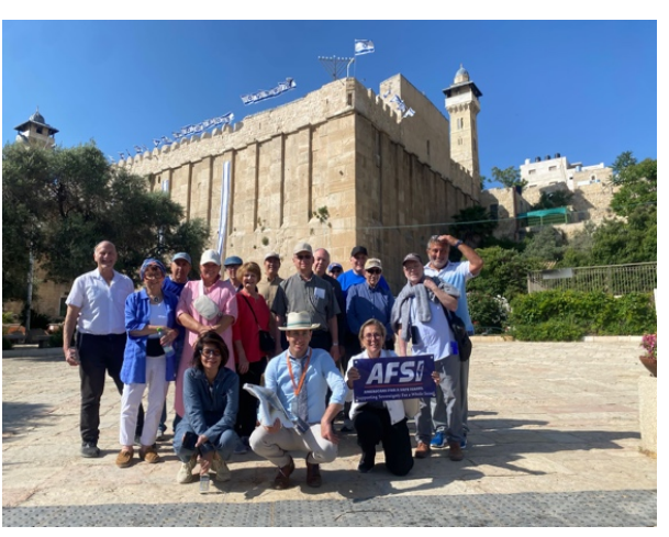
At Ma'arat HaMachpelah in Hebron

Next, not to miss a meal, it is time for some nourishment and maybe a little shopping, as we stop at a local shopping center with some great kosher choices and a handful of nice shops.