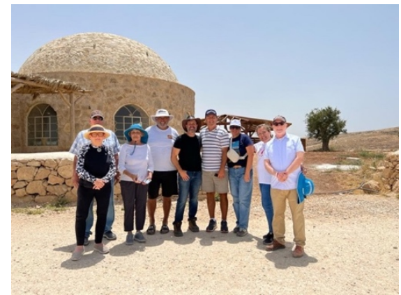
At beautiful Arugot Farm

Waking up to a beautiful Gush Etzion day, it was a true delight to enjoy our morning coffee in the backyards of the Kfar Etzion guest cottages with its beautiful views of the Judean Hills.