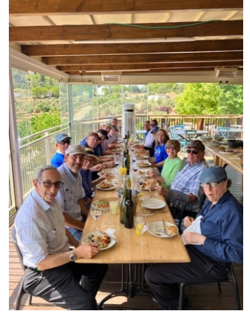
Lunch in Elon Moreh