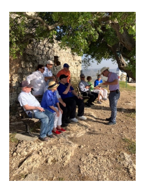
In Har Kabir: (L) Group chat (R) Scenic view