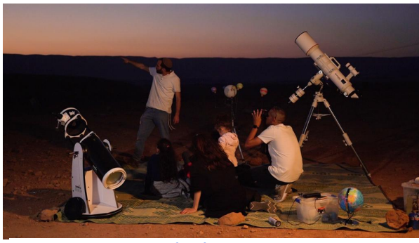
Stargazing the sky in Mitzpe Ramon

world's largest erosional crater. Here from the edge of what is often referred to as Israel's Grand Canyon, we not only get some extraordinary views we also get a bit of a geology,