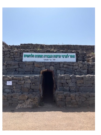
Tel Saki Bunker