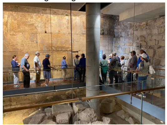
Touring inside the Kotel tunnel

being Yom Yerushalayim, there was a special electricity in the air. Our destination in the Muslim Quarter was a Jewish