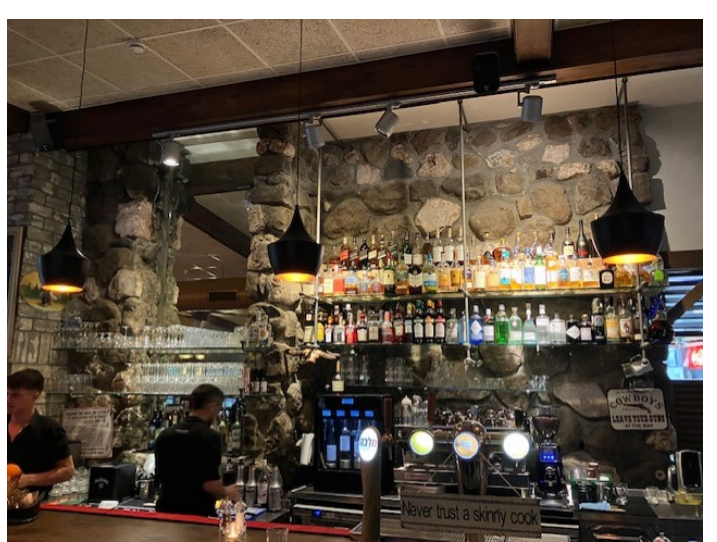
Above L & R at Vered Hagalil: Student on horseback; bar inside the restaurant