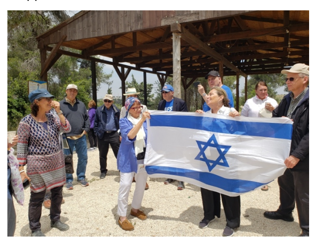
In front of the Pergola at the Compound