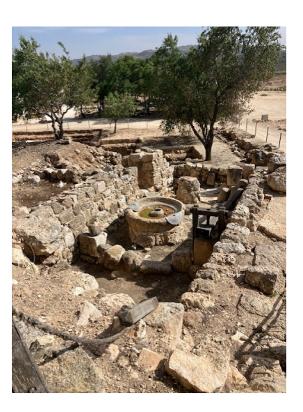
4th stop Shiloh , first a quick stop in the village of Shiloh for lunch, which was for most some pizza or some items from their small supermarket.

Next, a most interesting archeological tour, led by our guide Rabbi Alon, of Ancient Shiloh the first capital of Israel with many layers of history going back 3,000 years. Before we leave Shiloh, we have arranged for ATV rides and I'm not sure any of us knew what to expect but this was special. What we got was an action-packed hour where with 4 people per vehicle, we followed Boaz, our guide/leader, who at the halfway mark shared some excellent local insight with us, through the vineyards, farmland, and foothills of this picturesque, historically important and thriving Jewish region located in the heart of the Jewish Homeland.