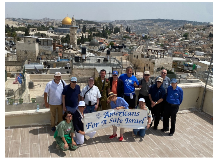
Atop the House with the View overlooking Jerusalem and Har HaBayit

Next, we walked back through the Old City toward the Jaffa Gate and in the direction of our hotel on King David Street, but first a really nice outdoor lunch at one of the many great spots that make up the Mamilla Mall. The food was great, and the energy was ramping up as the Yom Yerushalayim celebration was getting ready to kick into gear. Time for a free late afternoon to get ourselves checked into the recently beautifully renovated and rebranded Cassia Hotel (formerly the King Solomon hotel) on King David Street where our luggage awaits. With plenty of time to walk the streets of the city, join in the Parade and celebrate, get some rest or whatever one wanted to do. For dinner tonight we are on our own, and tomorrow is going to be another big day!!