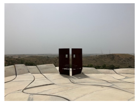
Sderot Overlook to Gaza

Back on the bus and headed northwest to our next destination, our beloved city of Sderot which sits in the northern Negev less than seven hundred yards from the Gaza Strip. Our first stop is at Emunah Sderot, where we learn about the organization, the new facility and the nature of their work providing therapeutic services (think PTSD) to Israel's most vulnerable citizens; one child and one family at a time.